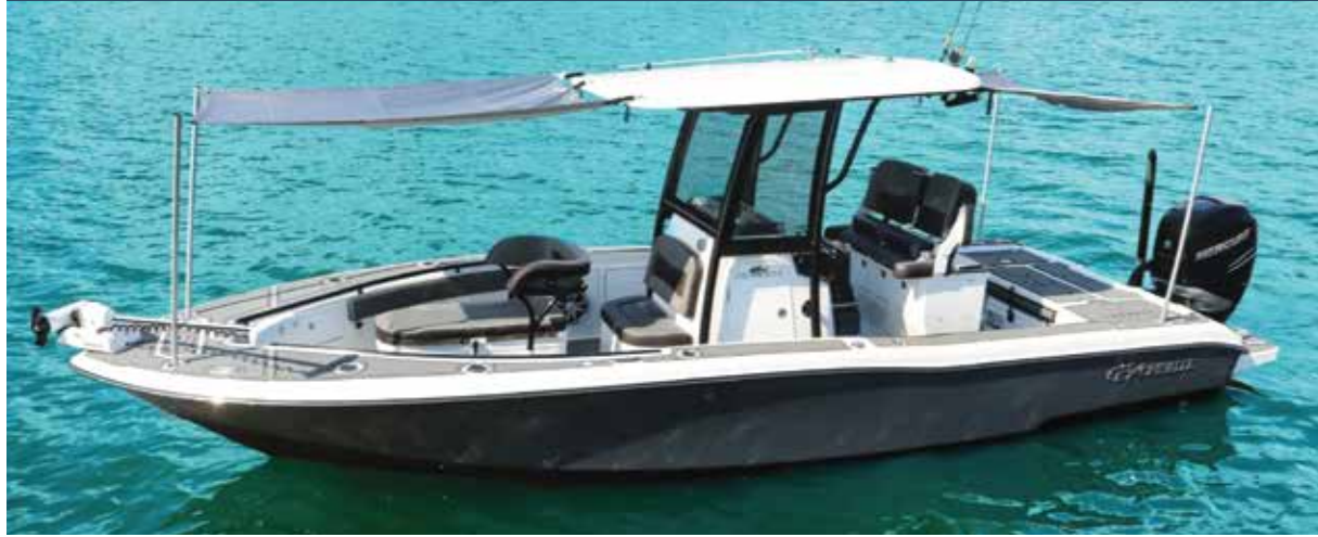
White Side, Black Bottom, Black Powder Coat, Charcoal Upholstery